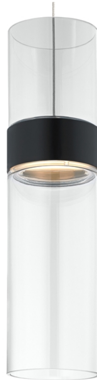
Clear / Clear Black Ring