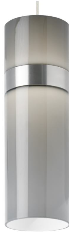
Smoke / Smoke Satin Nickel Ring