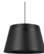
Textured Black / Black