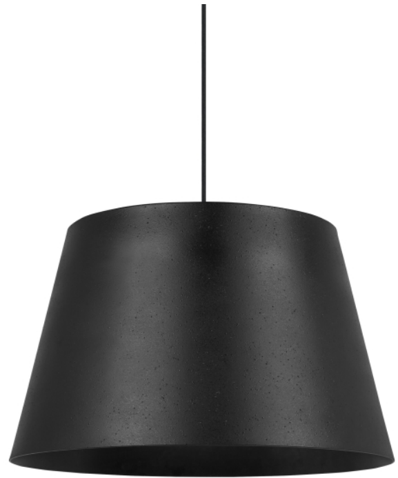
Textured Black / Black