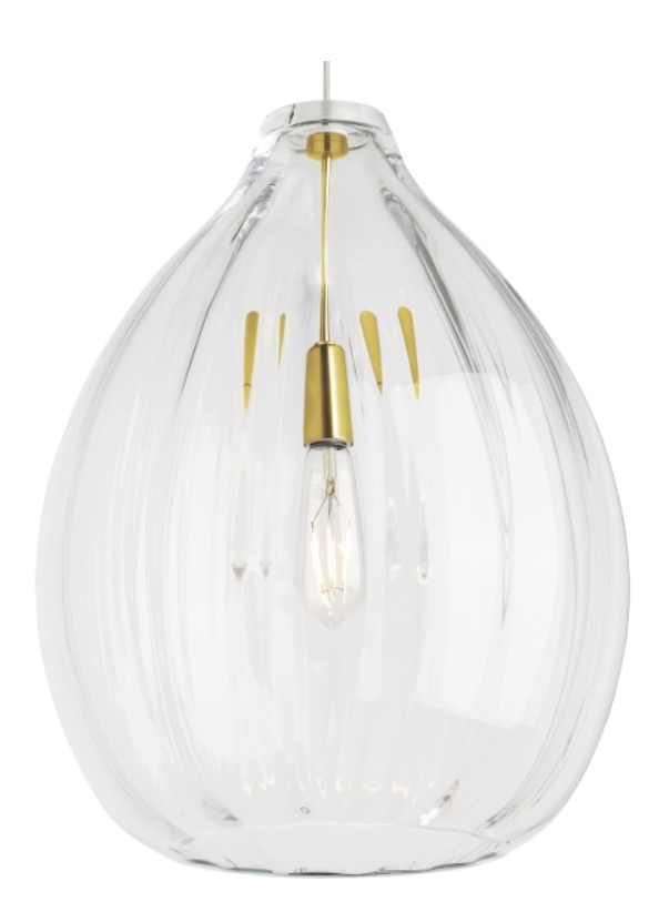
Clear/Natural Brass Incandescent