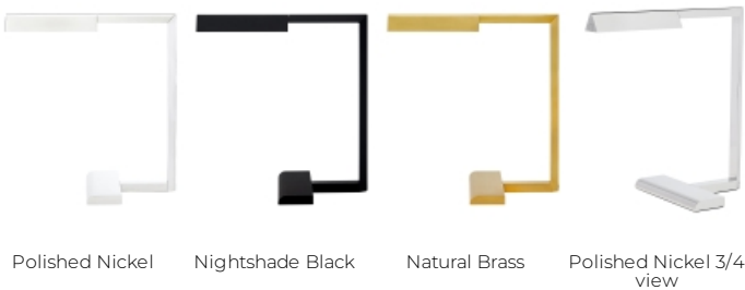
Polished Nickel Nightshade Black Natural Brass Polished Nickel 3/4 View

To view all available finish options, please visit techlighting.com