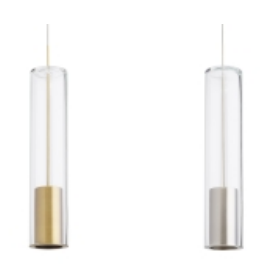
Clear/Aged Brass Clear/Satin Nickel