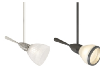
Satin Nickel With Soda Glass Shade Accessory