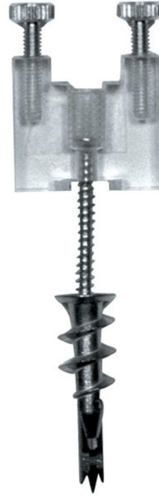
Wall MonoRail Standoff

Order one for every three feet of run and at corners.