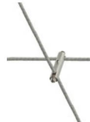
Kable Lite Power Jumpers