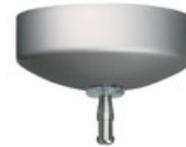
MonoRail Surface Transformer-60W EI LED