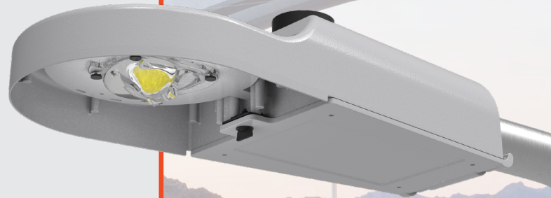
VERD-S Verdeon Small