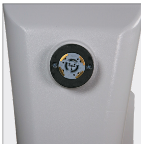
7-PIN NEMA Twistlock Photocontrol Receptacle