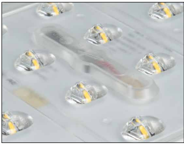
Precision AccuLED optics Choice of 16 optical distributions for maximum control and system efficacy.