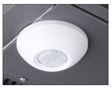
Controls Integrated photocontrol, motion sensor, or connected controls solutions available.