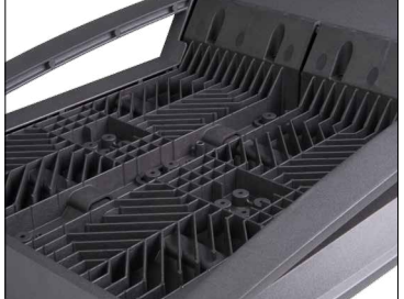
Advanced materials Thermally conductive polymer heatsink reduces overall size and weight.