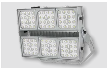
6 Square - Yoke Mount