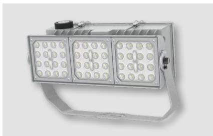
3 Square - Yoke Mount