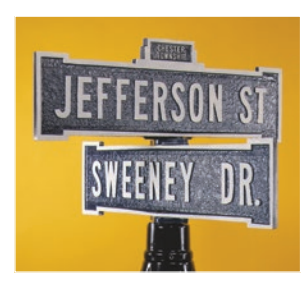
ADMIRAL A2-236 23"x 6" Four-way twin post top with inset top

Aluminum blade signs with vinyl lettering