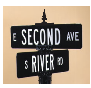
DRAKE D2-246 24"x 6" Four-way twin post with spike

These weather resistant street signs will enhance your street or area with a highly reflective background and very sharp lettering.