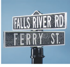
SHERIDAN S2-214 21"x 4" Four-way twin post top with cap