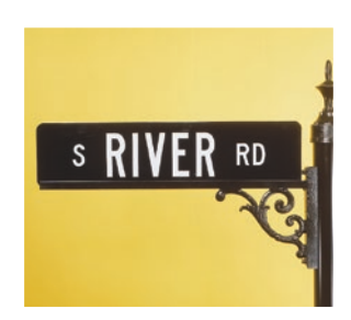
BROADWAY B246 24"x 6" Two-way side mounted

Aluminum blade signs with vinyl lettering