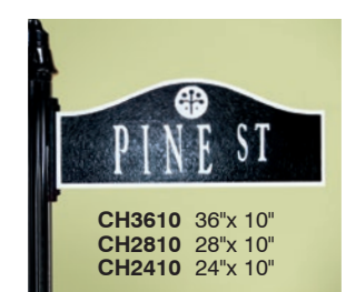
CHERRY HILL 3 Sizes Two-way side-mounted with cap