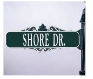
GATEWAY G-256 25"x 6" Two-way side-mounted with cap