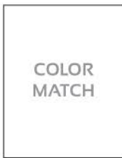
CM - CUSTOM MATCH