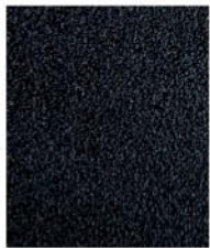
BKT - BLACK TEXTURED