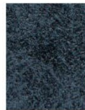
WBK - WEATHERED BLACK