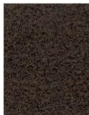
RT - RUST