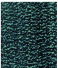
VG - VERDE GREEN