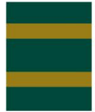
TT - TWO TONE