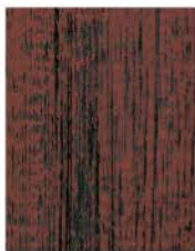
OI - OLD IRON