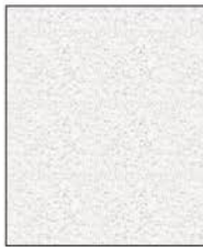
WHT - WHITE TEXTURED