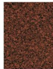
CD - CEDAR