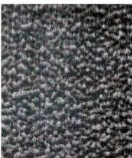
SI - SWEDISH IRON