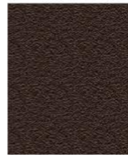
DBT - DARK BRONZE TEXTURED

Smooth finishes are available upon request