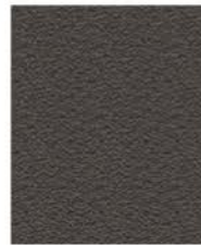
ABZT - ARCHITECTURAL MEDIUM BRONZE TEXTURED