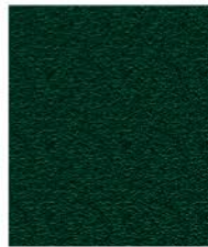
PGT - PARK GREEN TEXTURED