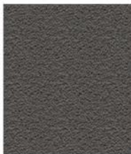
OWGT - OLD WORLD GRAY TEXTURED