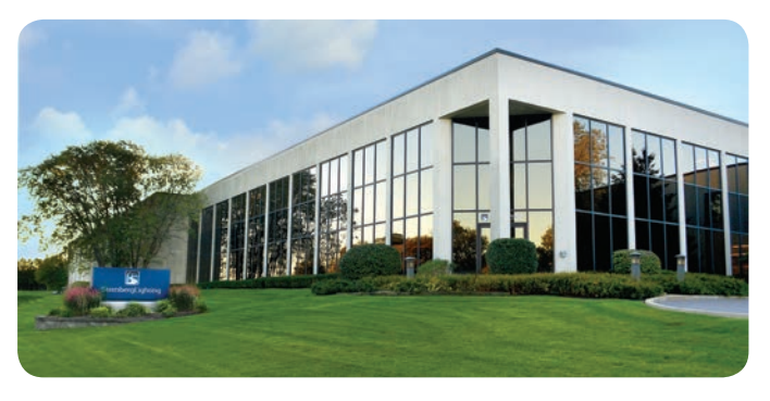
LOCATED IN ROSELLE, IL Engineered, Tested and Assembled in the USA!

Sternberg Lighting has created a legacy of old world craftsmanship that dates back to the company's inception in 1923. The work ethic and product innovations that made the early Sternberg company successful are still being practiced today by our Employee Owners. Our dedicated staff, attention to detail, and quality production processes are what make Sternberg a world class company.