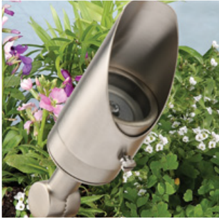
Model: Super Nova