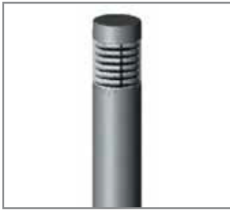
Model: SPJ51-20 Finish: Custom Powder Coat

Finish: Our naturally etched finishes will withstand the test of time. All finishes are individually treated insuring consistency. Our meticulous application results in a fixture that truly becomes "a one of a kind".