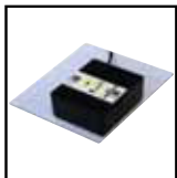
4.5W Sandwich 12V or 120V 4.5W 250 Lumens