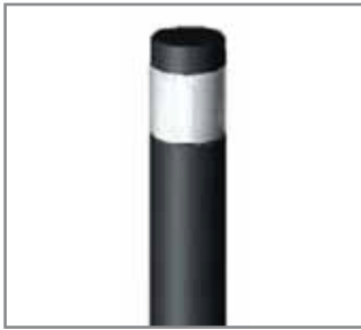
Model: SPJ51-10 Finish: Powder Coat Black

Finish: Our naturally etched finishes will withstand the test of time. All finishes are individually treated insuring consistency. Our meticulous application results in a fixture that truly becomes "a one of a kind".