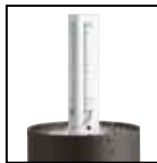
FB-MP3200 120V 25W 3200 LUMENS