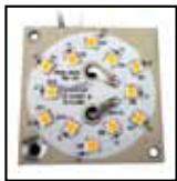
FB-MP1000 120V 10W 1000 LUMENS