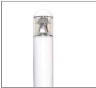
Model: SPJ51-09 Finish: Powder Coat White

Finish: Our naturally etched finishes will withstand the test of time. All finishes are individually treated insuring consistency. Our meticulous application results in a fixture that truly becomes "a one of a kind".