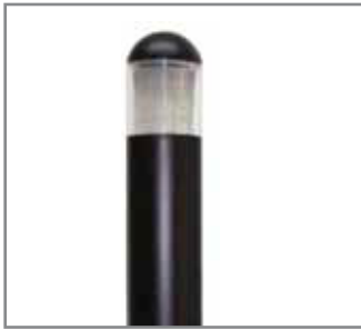
Model: SPJ51-08 Finish: Powder Coat Black

Finish: Our naturally etched finishes will withstand the test of time. All finishes are individually treated insuring consistency. Our meticulous application results in a fixture that truly becomes "a one of a kind".