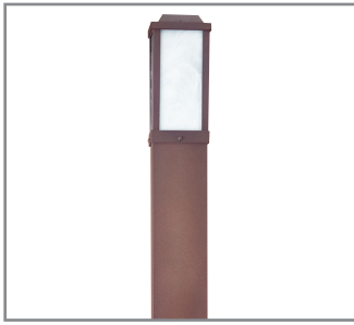
Model: SPJ51-04 Finish: Rusty