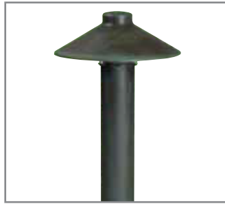
Model: SPJ150-B Finish: Moss