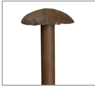
Model: SPJ140-M Finish: Rusty