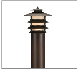
Model: SPJ126-4 Finish: Matte Bronze