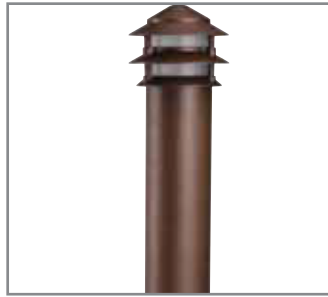
Model: SPJ12-01B-CB3-3 Finish: Matte Bronze