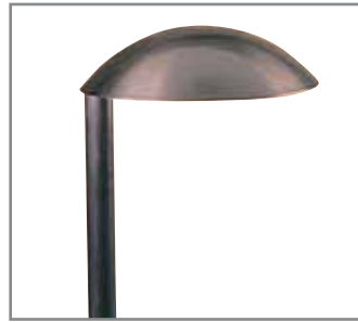
Model: SPJ10-02 Finish: Matte Bronze