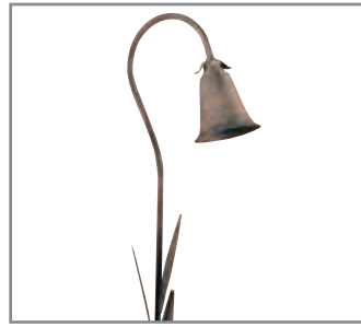
Model: SPJ08-05 Finish: Rusty