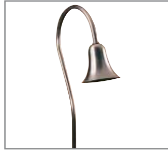
Model: SPJ08-04 Finish: Aged Brass