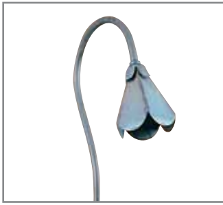
Model: SPJ07-05 Finish: Verde