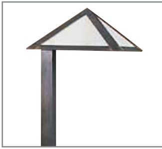
Model: SPJ07-02 Shown: Rusty / Honey Swirl