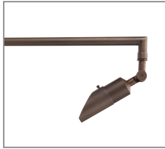
Model: SPJ-WM-1600 (LED) Finish: Bronze