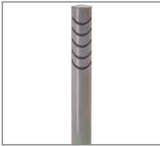
Model: SPJ-TW1-15 Finish: PVD Satin