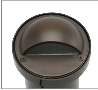
Model: SPJ-MW1000-P-EB Finish: Matte Bronze