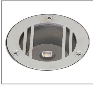
Model: SPJ-MW-1000-GR Finish: PVD Satin