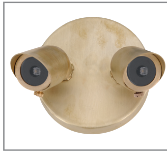
Model: SPJ-MU2 Finish: Satin Brass