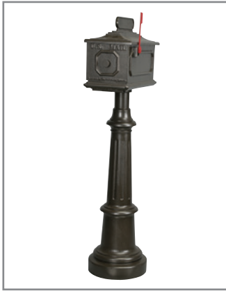
Model: SPJ-MB2 Finish: Powdercoat Bronze

Finish: Our naturally etched finishes will withstand the test of time. All finishes are individually treated insuring consistency. Our meticulous application results in a fixture that truly becomes "a one of a kind".