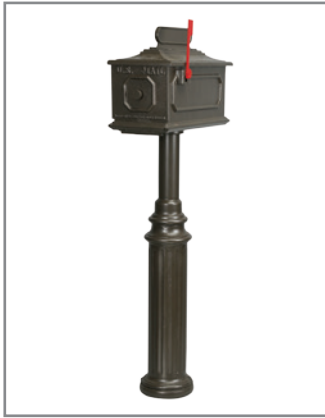
Model: SPJ-MB1 Finish: Powdercoat Bronze

Finish: Our naturally etched finishes will withstand the test of time. All finishes are individually treated insuring consistency. Our meticulous application results in a fixture that truly becomes "a one of a kind".