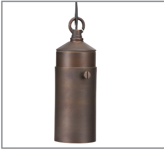
Model: SPJ-HT6 Finish: Matte Bronze

Finish: Our naturally etched finishes will withstand the test of time. All finishes are individually treated insuring consistency. Our meticulous application results in a fixture that truly becomes "a one of a kind".