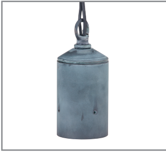
Model: SPJ-HSN5 Finish: Verde