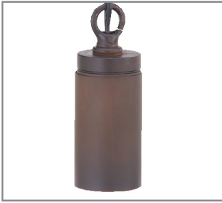
Model: SPJ-HMU-3 Finish: Matte Bronze