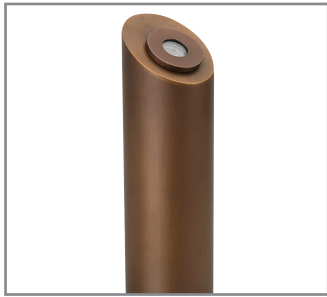
Model: SPJ-Highliter-3 Finish: Matte Bronze