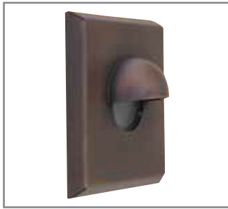
Model: SPJ-GDG-3SQ Finish: Matte Bronze