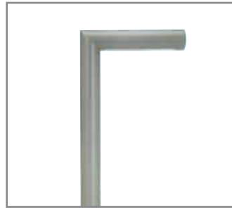
Model: SPJ-DS24 Finish: PVD Satin