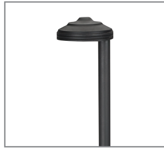
Model: SPJ-DR100-2 Finish: Black