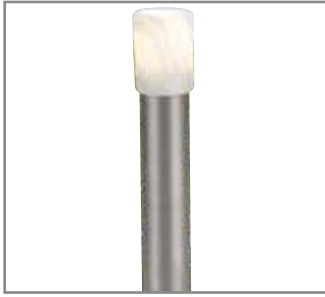
Model: SPJ-CPL-HS3 Shown: PVD Satin / White Onyx