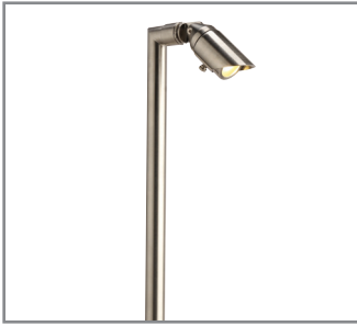
Model: SPJ-BL-101 Finish: PVD Satin

Finish: Our naturally etched finishes will withstand the test of time. All finishes are individually treated insuring consistency. Our meticulous application results in a fixture that truly becomes "a one of a kind".