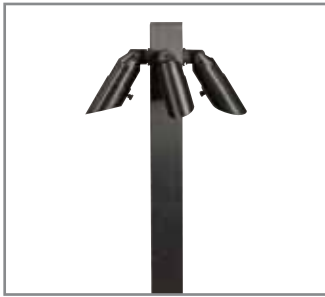
Model: SPJ-23D Finish: Gun Metal