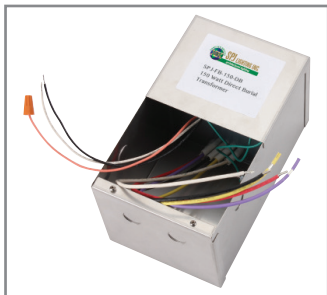
Model: FB-150DB Direct Burial