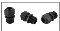
Model: IP68 Fitters (recommended)

Model#: FB-300DB Shown: Stainless Steel Electrical Input: 120V, 277V Electrical Output: 12-15V Max. Watts: 300 Watts Circuit: 1 Circuit